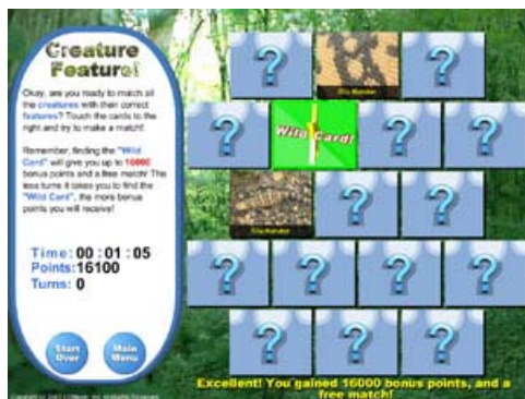
point2explore Creature Feature with Standard Customization

Value Added Customization: Our games and programs can also be customized beyond the standard customization. From background images and button designs to custom functionality, the customization options are just about endless. We can utilize supplied images. We can design a custom look to compliment existing designs. We can even add functionality to the code. Utilizing Value Added Customization gives you the ability to develop an affordable and custom multimedia software program.