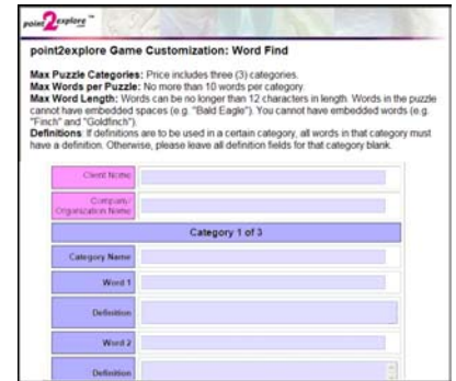
point2explore's online customization form

We have made the customization process very simple. Customers will receive web links to instructions and simple online forms to enter the data in the correct format. Simply submit a form for each game you have purchased and we will implement your data into the game or program.